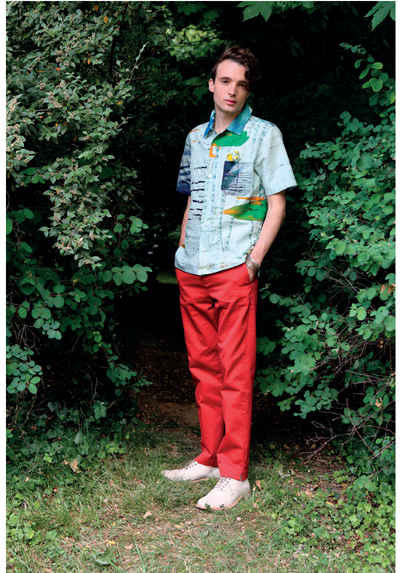
cotton artist © Elzo faces print shirt, rust overdyed cotton pants